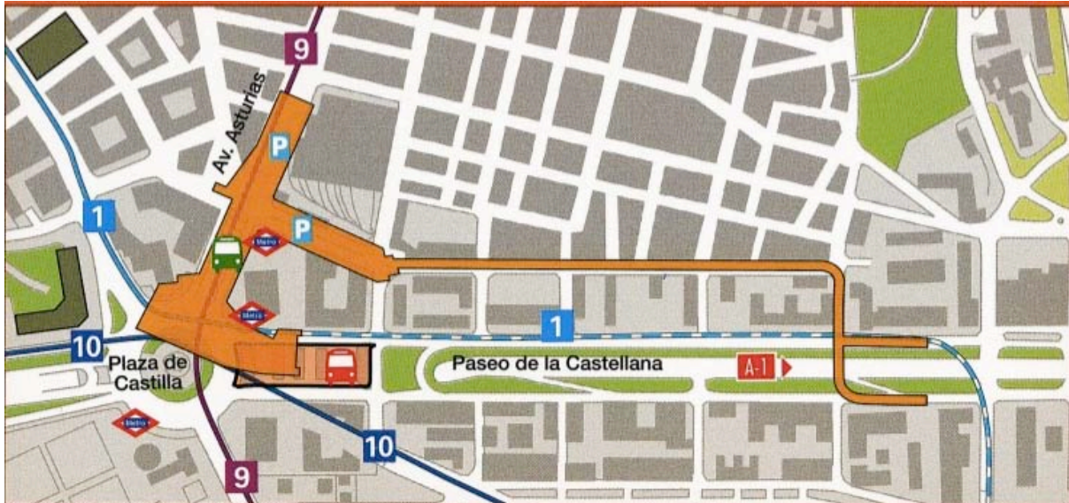
Location of the transportation hub